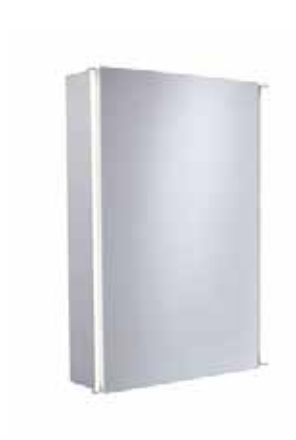
Sleek Single Door SL44AL