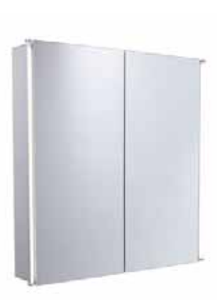
Sleek Double Door SL60AL